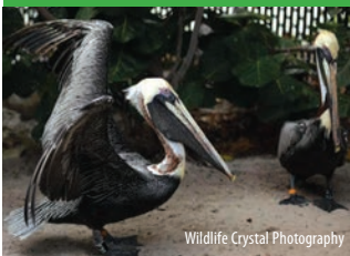
Pepe & Enrique $300