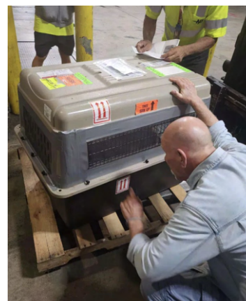
Penny arrives at MIA Airport