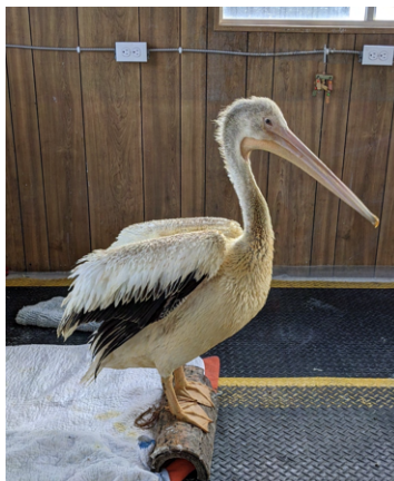
Penny at Turtle Pond